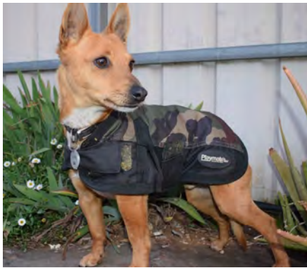
Beat the winter with dog coats and horse rugs now in stock

We are still selling seeds for sowing pasture or crops.