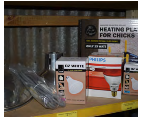
LAMPS, GLOBES, HEATERS AND SUPPLIES FOR YOUR CHICK REARING