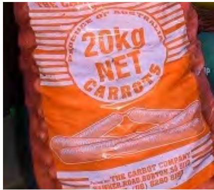
CARROTS still only $6.50 for a 20kg bag