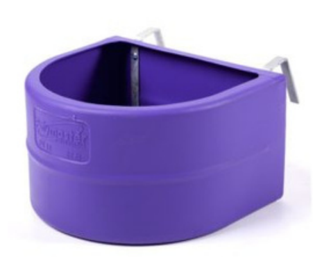
POLYMASTER specials on feeders and troughs see catalogue in store