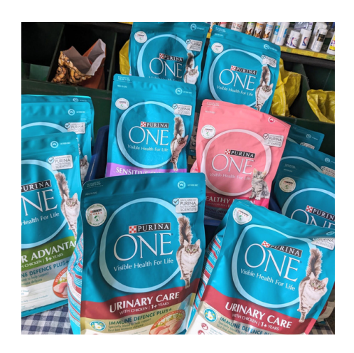
NEW PRODUCT Purina One cat food introductory offer of 3 FREE sachets of wet food when you buy dry food

Salt Licks for your animals contain the necessary minerals to supplement when they need it most.