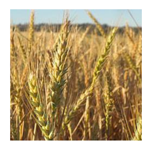
Seed available now for crop/pasture improvement